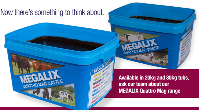
Available in 20kg and 80kg tubs, ask our team about our MEGALIX Quattro Mag range

MEGALIX Quattro Mag Sheep is also available, featuring all the benefits of MEGALIX Quattro Mag Cattle, however does not include copper.